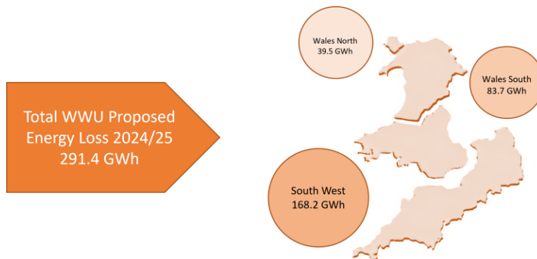
Figure 1 WWU Proposed Energy Loss

The Energy Loss for 2024-25 is estimated at 0.46% of total demand through the WWU system.