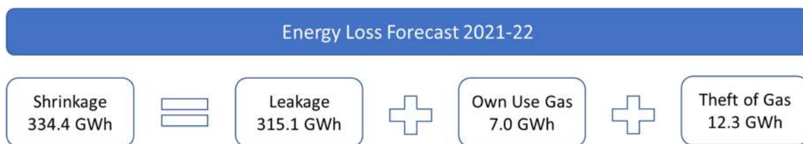
Figure 2: Breakdown of Shrinkage

WWU's Energy Loss proposals are forecasted by calculating the forecasted Shrinkage for the respective Formula Year. The below diagram provides a high level breakdown of Shrinkage gas with values forecasted for 2021-22.