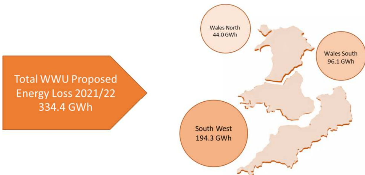
Figure 1: Breakdown of Energy Loss by LDZ

Fugitive emissions of gas (leakage and venting) have been estimated using forecast asset population as at 31 st March 2021. WWU has considered Own Use Gas (OUG) and Theft of Gas (ToG) and propose using the same factor as previous years. The Energy Loss for 2021-22 is estimated at 0.55% of total demand through the WWU system.