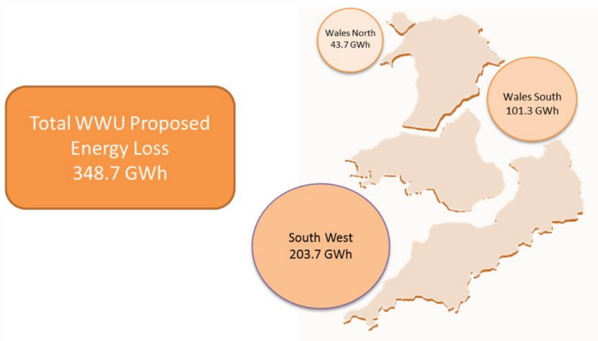
Figure 1: Breakdown of Energy Loss by LDZ

Fugitive emissions of gas (leakage and venting) have been estimated using forecast mains and asset populations as at 31 st March 2019. WWU has considered Own Use Gas (OUG) and Theft of Gas (ToG) and propose using the same factor as previous years. The Energy Loss for 2019/20 is estimated at 0.54% of total demand through the WWU system.