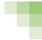
2A.5 - Read performance: January vs December 2020 PC1