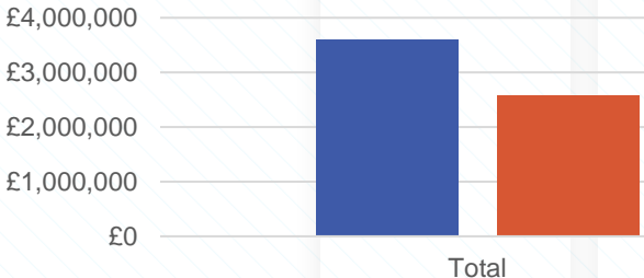
Total Committed Spend v Approved Budget