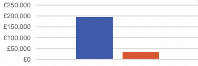
IGT Committed Spend v Approved Budget