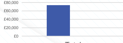
NTS Committed Spend v Approved Budget