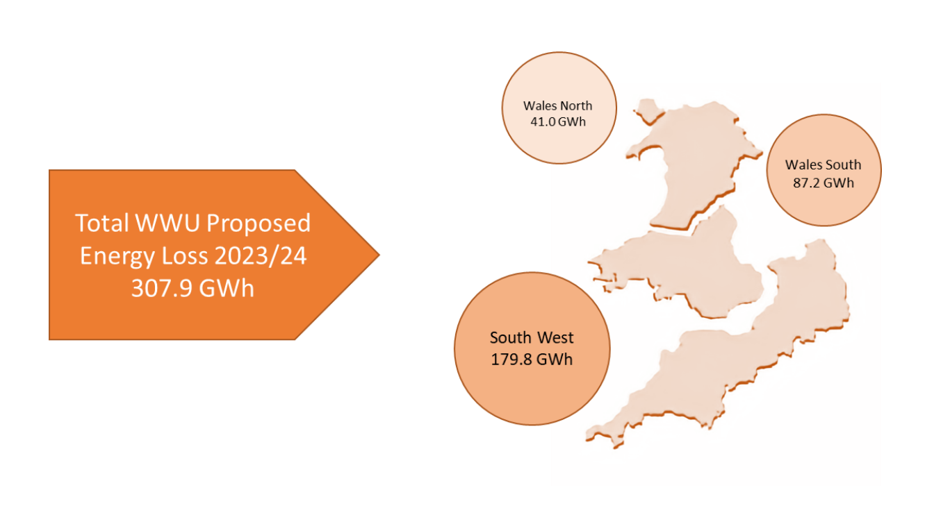
Figure 1: Breakdown of Energy Loss by LDZ