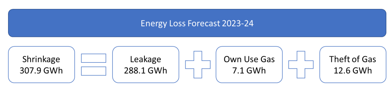
Figure 2: Breakdown of Shrinkage

WWU's Energy Loss proposals are forecasted by calculating the forecasted Shrinkage for the respective Formula Year. The below diagram provides a high-level breakdown of Shrinkage gas with values forecasted for 2023-24.