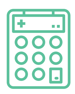
Table 4A - Breakdown of Prior Year Charges (Rebates) / Additions